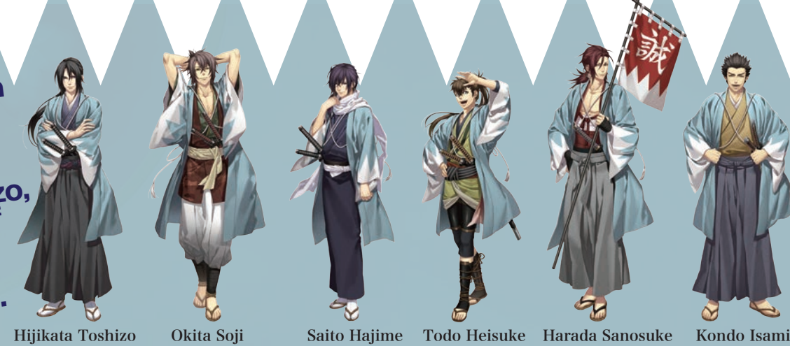
Hijikata Toshizo Okita Soji Saito Hajime Todo Heisuke Harada Sanosuke Kondo Isami

"Hakuoki": a modern anime based on the legend of the Shinsengumi. I am Hijikata Toshizo, vice-commander of the Shinsengumi. I was born and raised in Hino City.